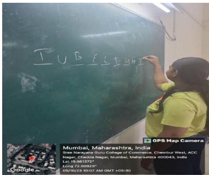
Word Fill activity was held from October 3 to October 7, 2023.

BMS Department conducted CV Writing sessions for both TYBMS HR and Marketing students, primarily focusing on teaching the appropriate layouts of CVs, their efficient and presentable use depending on the post and institution hiring, as well as the elements necessary to be added to them to make them look more professional as well as impressive for the hiring managers.