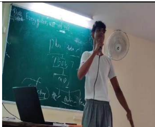
PPT Presentation on Market Segmentation was held on 2 nd September 2022