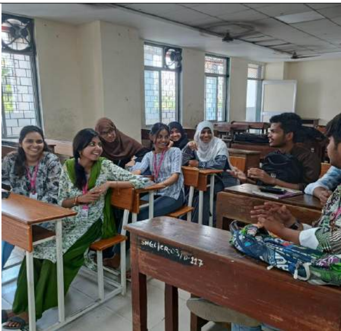
Group Discussion on the Merits and Demerits of the Use of Presentations

The group discussion on the topic "Entrepreneurship vs. Traditional Employment: Assessing Financial Rewards, Work Flexibility, and Lifestyle Risks after Graduation" was held on 04-08-2023. The aim of this discussion was to explore the various aspects of choosing between entrepreneurship and traditional employment after graduation. The discussion effectively brought together 59 participants, forming 11 diverse groups that engaged in insightful conversations, presenting their research findings and perspectives. Following these deliberations, three standout groups emerged, securing the 1st, 2nd, and 3rd positions, each contributing unique insights. The winner list is mentioned below