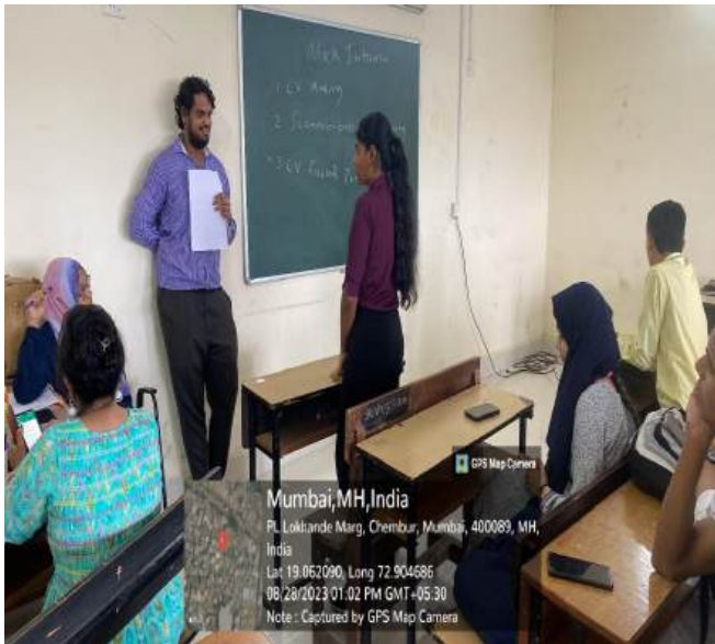
Mock Interview was held on 28 th August 2023