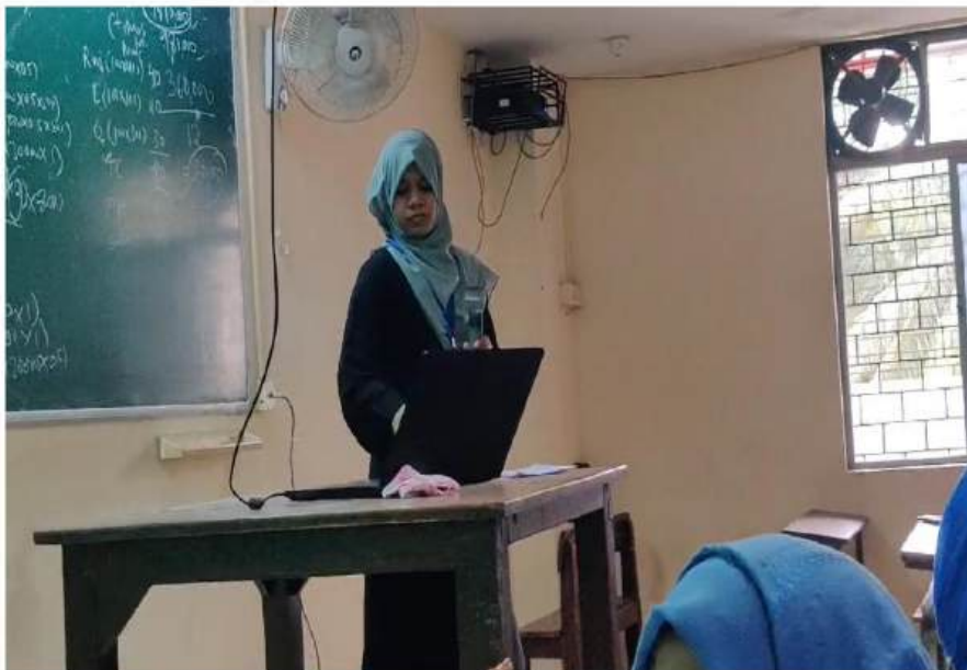
PPT Presentation on Indian Contract Act on 1 st September 2022