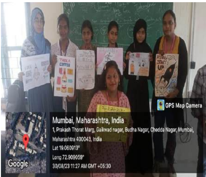
Poster Making and Presentation Competition