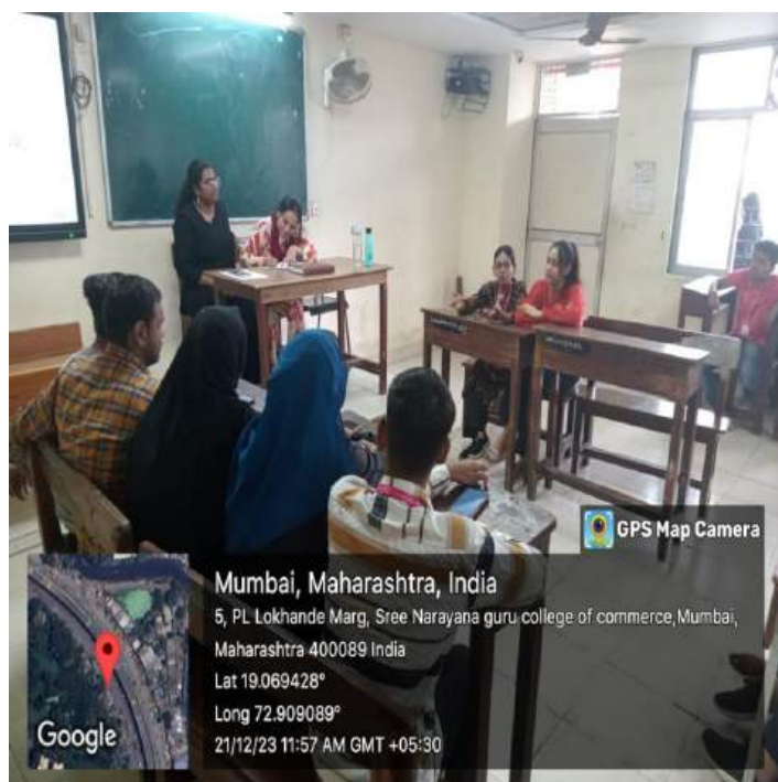
Debate Competition was held on 21 st December 2023

The Women Development Cell, in collaboration with the IQAC, organized a Debate Competition on December 21, 2023, in Room no 305. The event, held from 11:00 am to 12:00 pm, featured four teams with nineteen participants engaging in thought-provoking discussions on various topics. Debaters explored themes such as gender-specific peer pressure, the relationship between success and happiness, and the balance between professionalism and individual freedom in college dress codes. The competition highlighted the ability of participants to present compelling arguments supported by evidence, ultimately determining the winners based on the strength and clarity of their presentations.