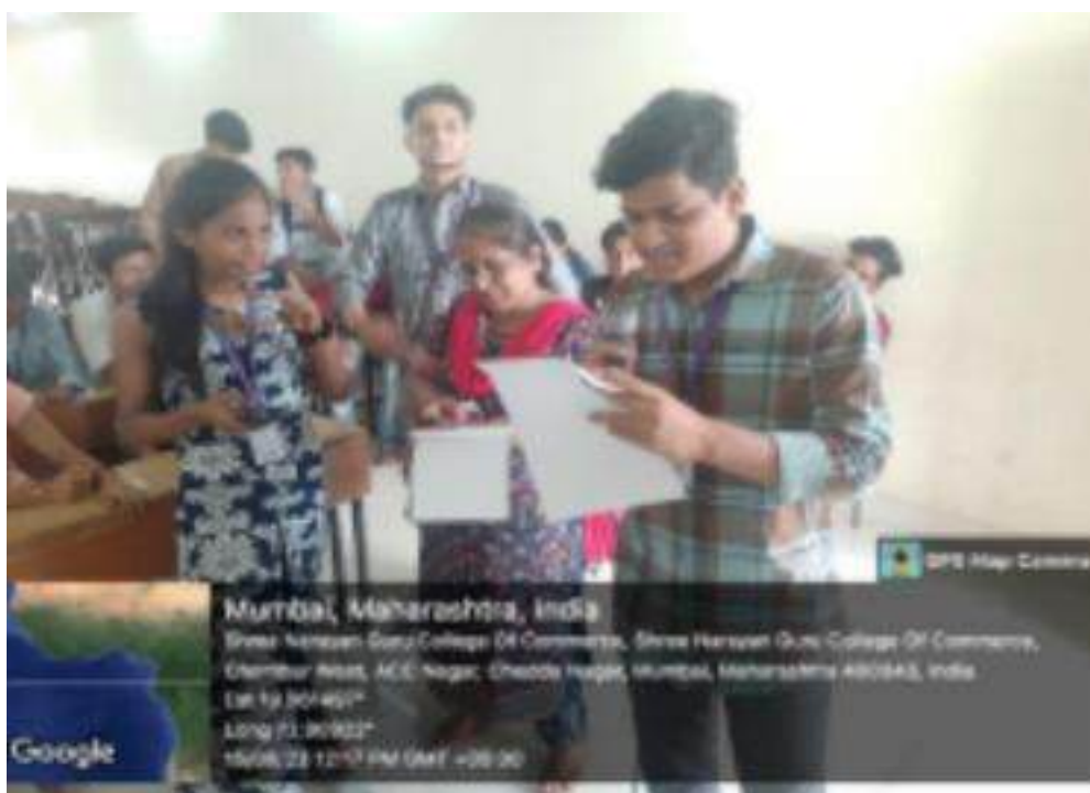
The Tongue Twister Event (Language based game) was held on 15 th September 2023