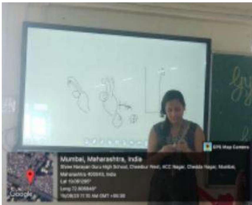
The Pictionary Event (Language based game) was held on 15 th September 2023