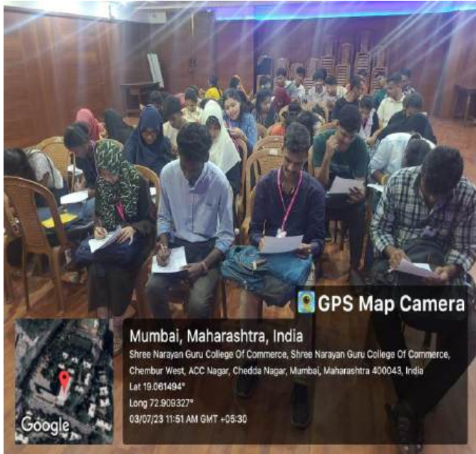
Poetry Writing Competition was held on 3 rd July, 2023