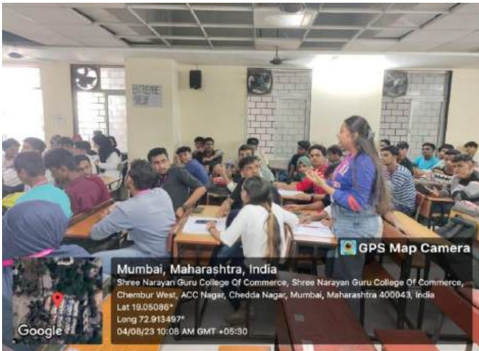
Group Discussion on "Entrepreneurship vs. Traditional Employment: Assessing Financial; Rewards, Work Flexibility, and Lifestyle Risks After Graduation"