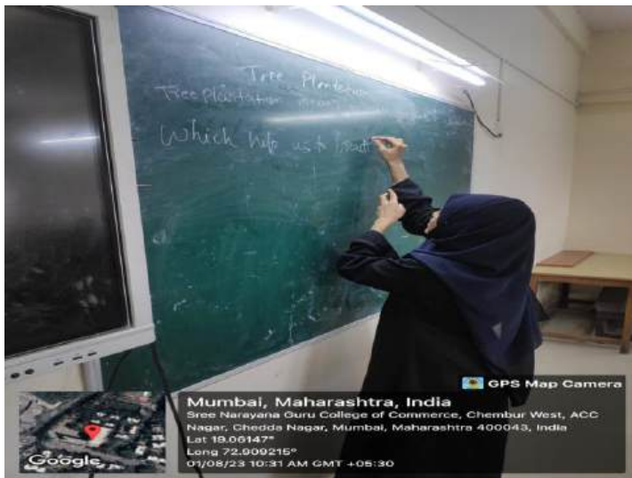
Collaborative Writing was held on 1 st August 2023

Collaborative Writing activity was conducted where a common essay topic is decided and each student has to write one sentence on it, but it should be a continuation of the previous sentence and the topic overall. This increases their teamwork and encourages them to think creatively and write concisely while being aware of sentence structuring and incorporating collaborative communication skills.