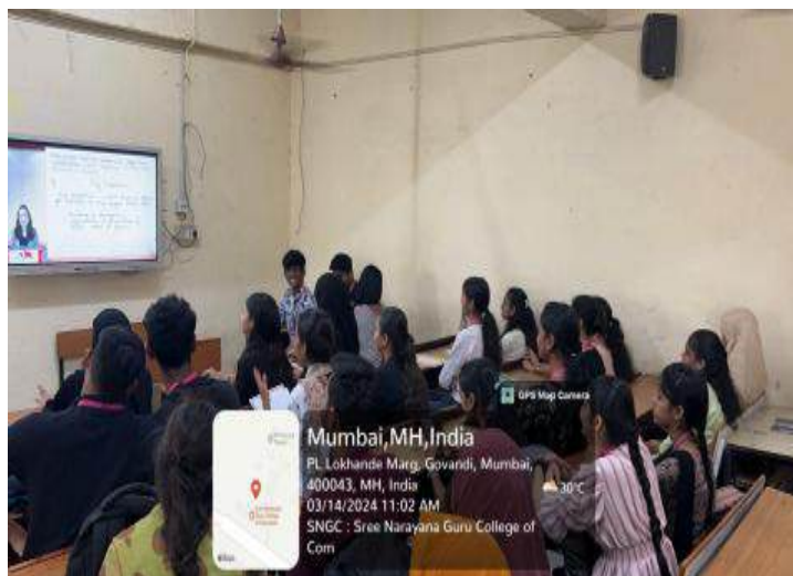
Interactive session conducted in Business Law III on 14 th March 2024