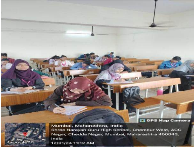
Essay Writing Competition on National Youth Day was held on 12 th January 2024