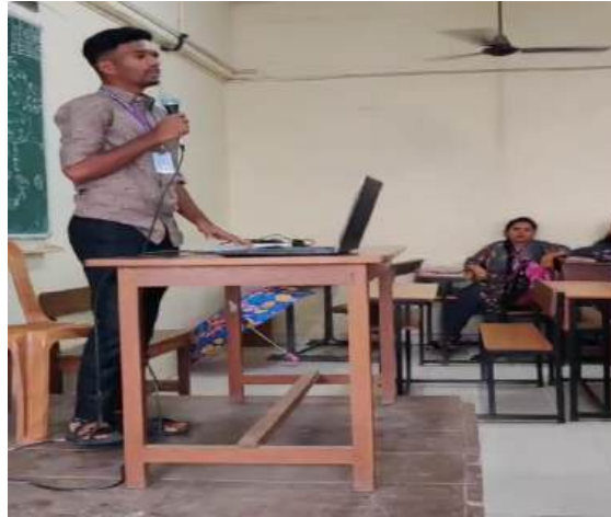
PPT Presentation on Special Contract was held on 4 th September 2023