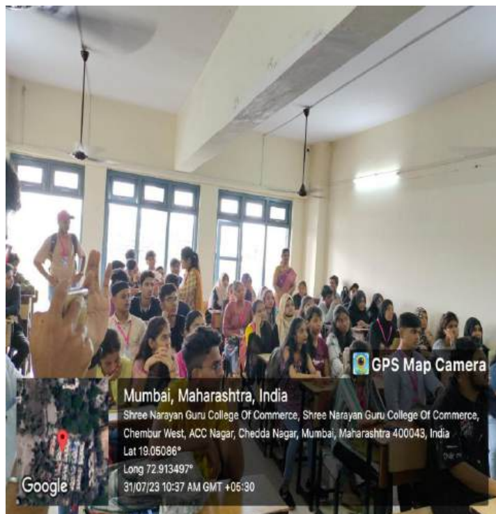
Group Discussions and PPT on the "G20 Summit