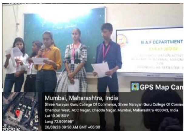
Class participation activity for Business Law Semester III was held on 26 th August 2023

Bachelor of Accounting and Finance (BAF) students participated in an interactive activity on 14 th March, 2024, focused on Business Law. This engagement aimed to boost collaboration, critical thinking, and active participation in classroom discussions. Students were encouraged to share their perspectives, ask insightful questions, and provide examples related to company law concepts. Through dynamic group work and peer-to-peer interactions, they effectively collaborated, challenged each other's viewpoints, and enhanced their understanding of the subject. The activity promoted deeper learning and developed essential skills such as communication and teamwork.