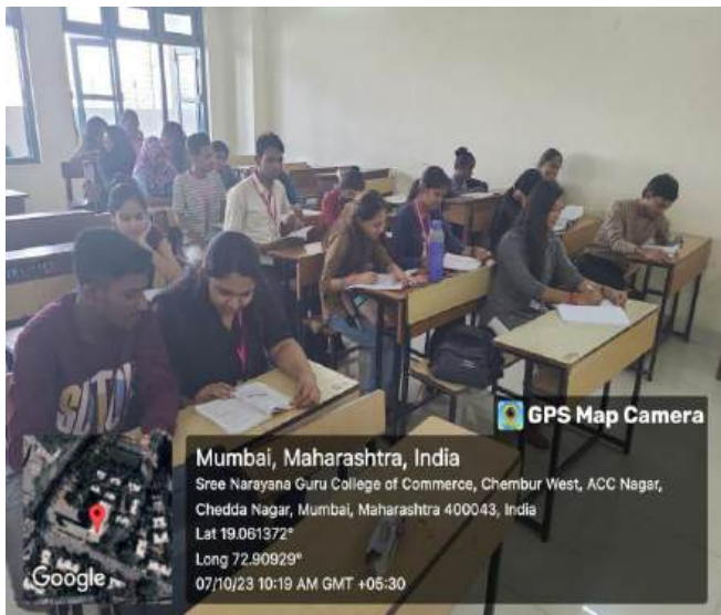
CV Writing session was held on 7 th October 2023