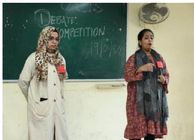
Students participated in a Debate Competition was held on 19 th June 2023

Debates are part of the Annual Inter/Intracollegiate Fests : Sanskriti and Oasis as well as of Departmental Fests.