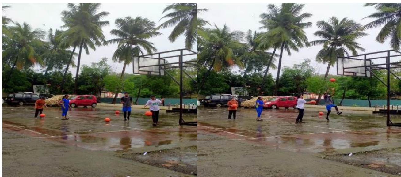
Basketball Competition 24.07.2024