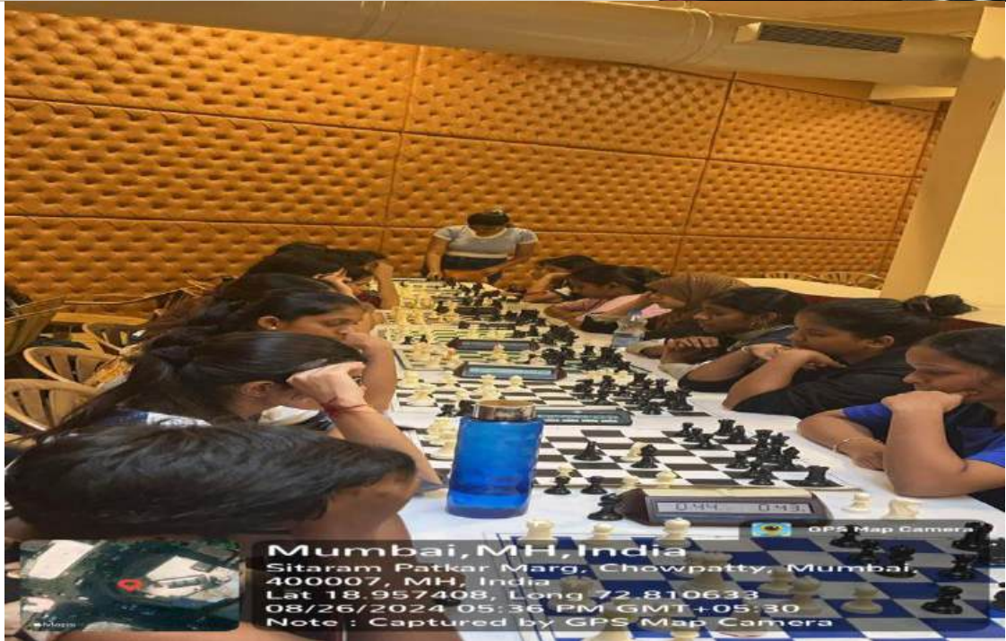
University of Mumbai Intercollegiate Zone 1 Chess Tournament (B/G) 26.08.2024 and 28.08.2024