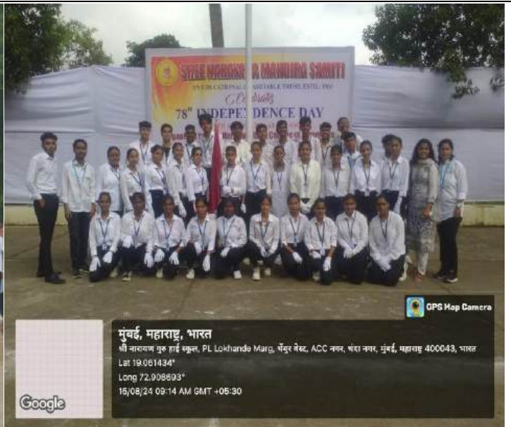
Independence Day Parade 15/08/202